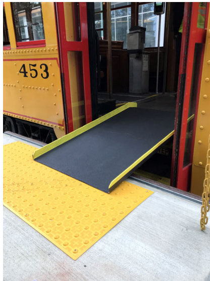
Plate with no load.jpg

View of MATA's new rail trolley service ramp in passenger loading position on rail Trolley 453. The use of carbon fiber instead of glass fiber gives the ramps more strength and durability over other standard materials, while retaining a lighter weight that's easier handle when compared to traditional metal service ramps.